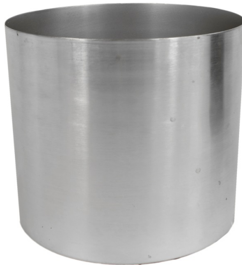
Figure 1: Cylindrical cup

Deep drawing is an essential process used for producing cups from sheet metal in large quantities. Understanding the mechanics of the cup drawing process helps in determining the general parameters that affect the deep drawing process.