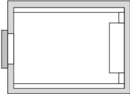
Top sectional View