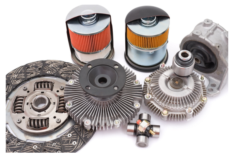
Figure 1: Applications of Al-SiC metal matrix composites.

This project aims at the potential of use Al-SiC metal matrix composite (MMC) with particular reference to the aerospace industry. In the present study a modest attempt has been made to develop aluminium based silicon carbide particulate MMCs with an objective to develop a conventional low cost method of producing MMCs and to obtain homogenous dispersion of ceramic material. Aluminium (98.41% C.P) and SiC (320-grit) has been chosen as matrix and reinforcement material respectively. Experiments have been conducted by varying weight fraction of SiC (5%, 10%, 15%, 20%, 25%, and 30%), while keeping all other parameters constant. An increasing trend of hardness and impact strength with increase in weight percentage of SiC has been observed. The best results (maximum hardness 45.5 BHN & maximum impact strength of 36 N-m.) have been obtained at 25% weight fraction of SiC.