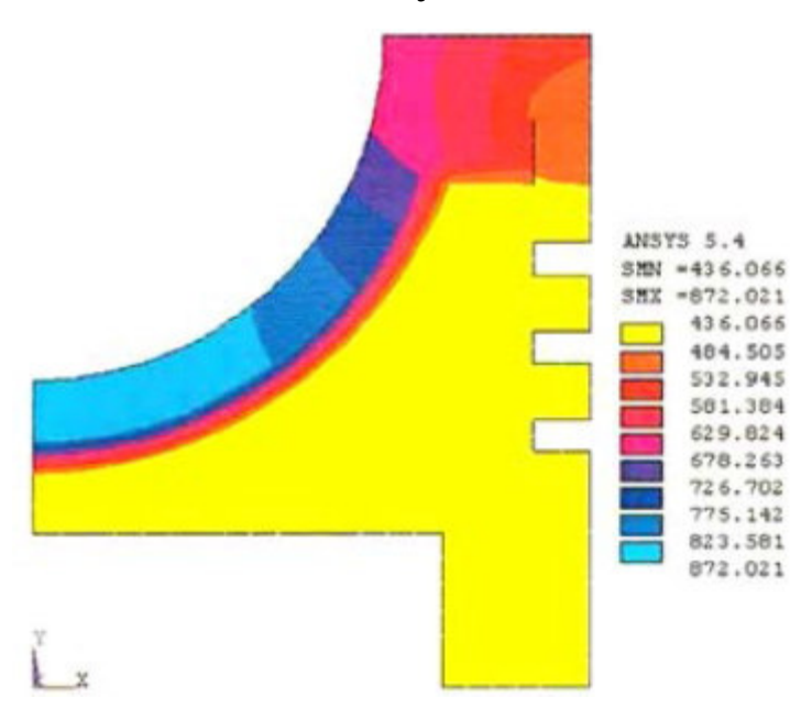
Figure 4: Temperature distribution in the air-gap piston with crown made up of the Si_3N_4/Al -alloy composite.