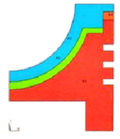
Figure 1: 2-D and 3-D geometric modeling of piston.

The temperature drop of 183.835°C, 233.289°C and 435.955°C was available in the piston crowns made up of Al-alloy, SiC/Al-alloy and Si<sub>3</sub>N<sub>4</sub>/Al-alloy composites. The heat loss to the coolant was minimum in the piston with crown made up of Si<sub>3</sub>N<sub>4</sub>/Al-alloy composite. The saving in thermal energy could increase the engine thermal efficiency.