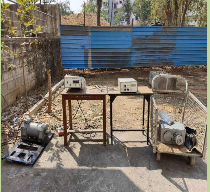
Advanced Geotechnical Engineering Laboratory