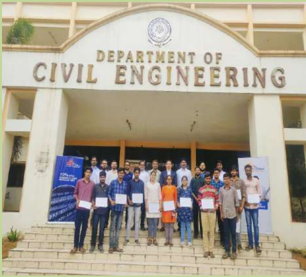
Photograph of the Students who received scholarship from M/s DEVA SHREE ISPAT PVT LTD (TMT) in December 2022