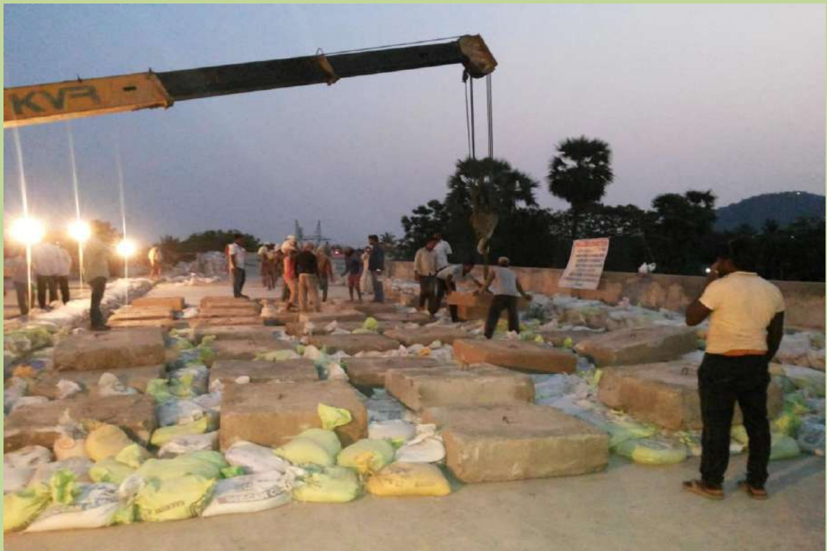
ICS Work : Load testing setup arranged for High level bridge at Bhimavaram