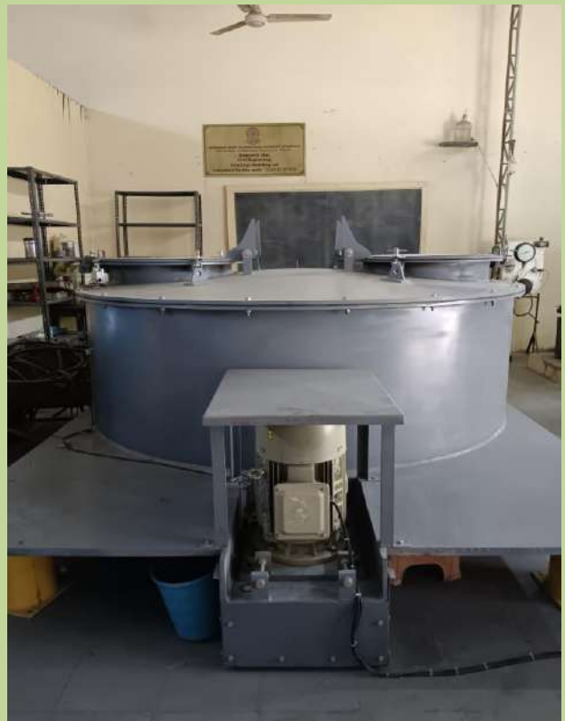
Advanced Structural Engineering Laboratory