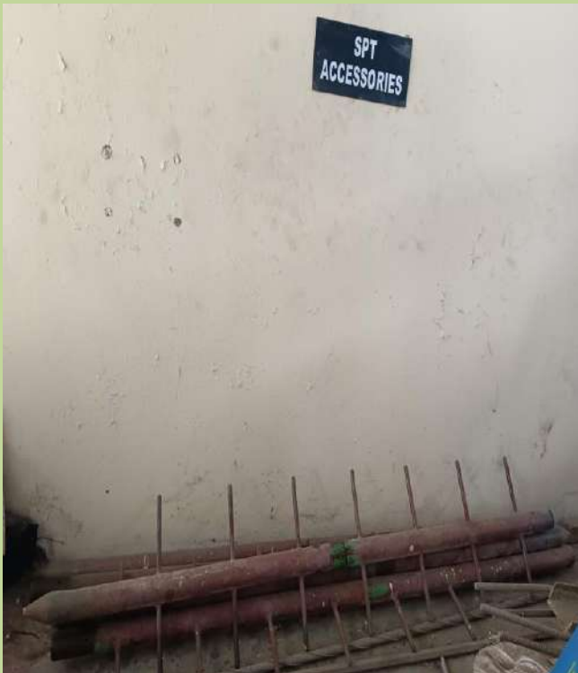
Advanced Geotechnical Engineering Laboratory