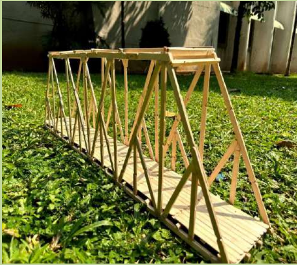
Model presented in STHAPATYA 2023 held on 26& 27 th April 2023