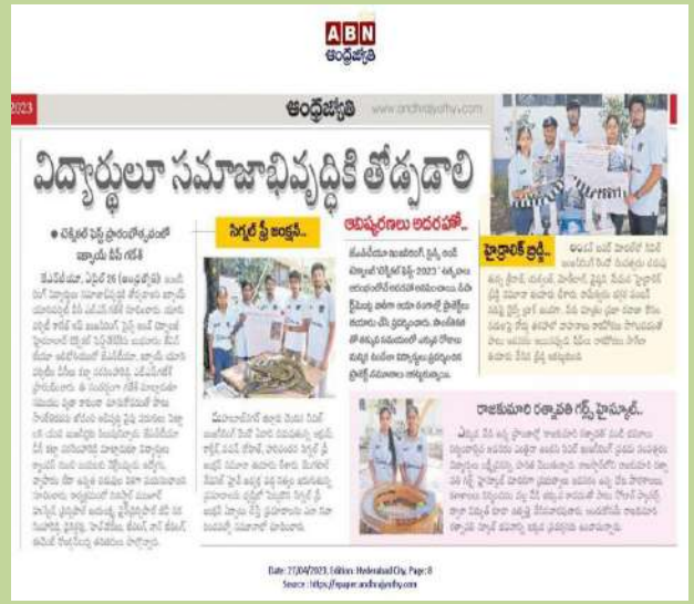
T News paper clipping of the events held during STHAPATYA 2023 published on 27 th April 2023