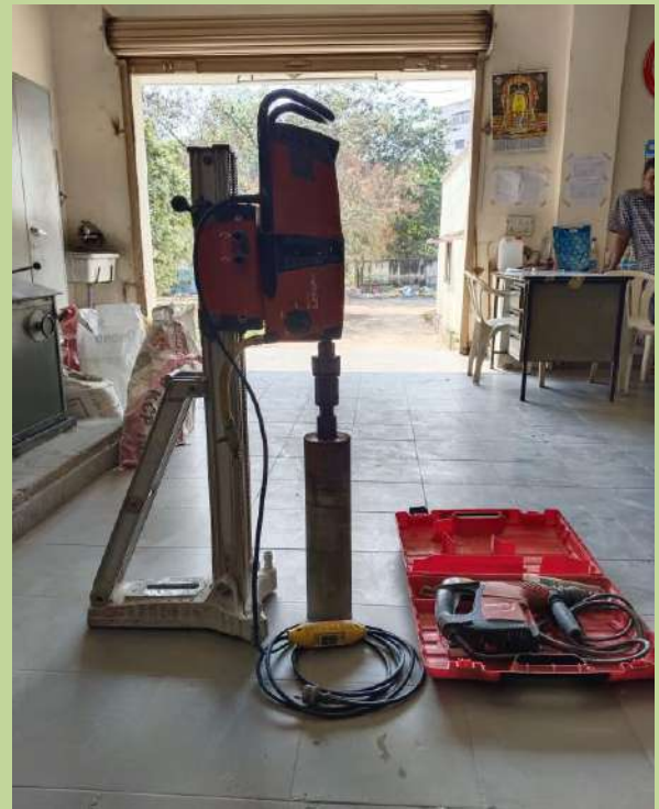
Advanced Structural Engineering Laboratory