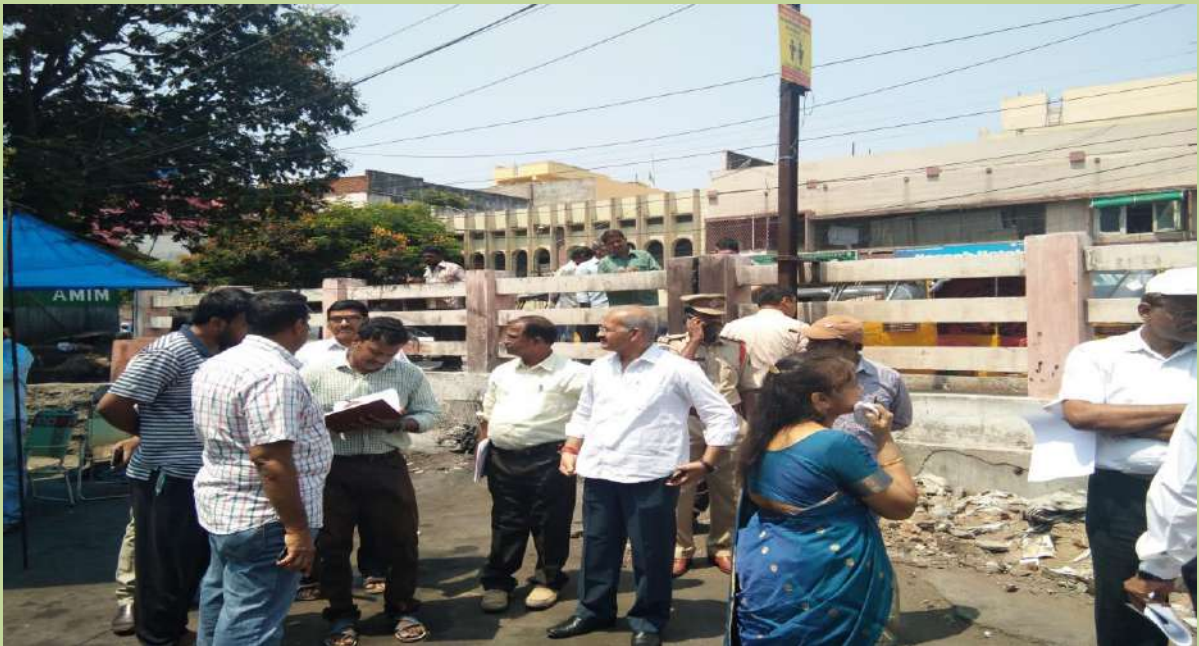
ICS Work : Site inspection of Nala at Dhoolpet, Hyderabad by the faculty of the Department on 14 th Nov. 2022