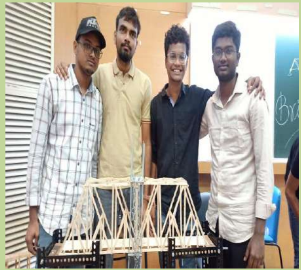
Photograph showing the model presentation by students at AAKAAR, Civil Engineering Technical Festival held at IIT Bombay on 18 th March 2023