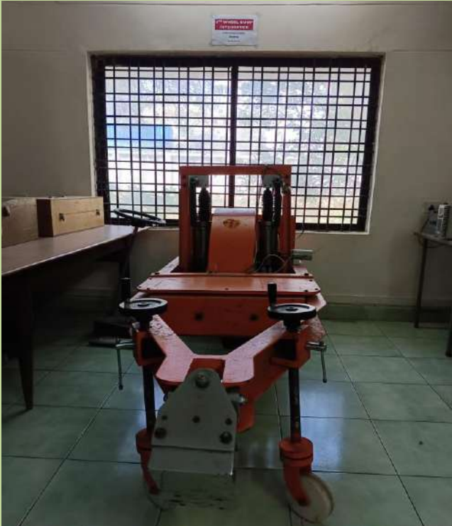
Transportation Engineering Laboratory