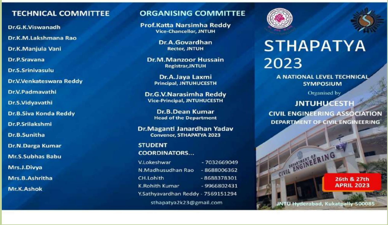
Brochure of the STHAPATYA 2023